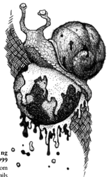
Rusty B. Supersnail drawing Image © Rusty B. 1999

The New York Times on the Web: http://www.nytimes.com ; http://www.nytimes.com/2001/01/19/science/reuters-china.html